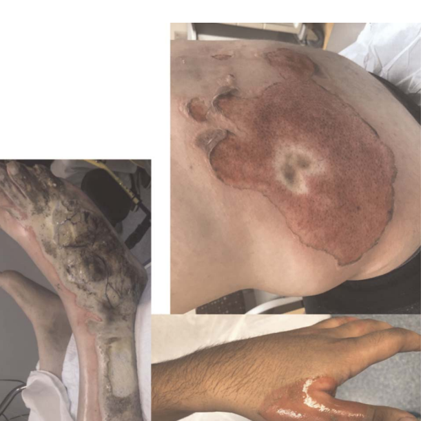
Figure 2. The top photo shows a deep (third degree) alkali burn from cleaning products. Note the leathery, dead appearance of the dermis and visible thrombosed vessels (which are not always this obvious). The bottom right picture is of a mixed deep partial thickness (second degree) and full thickness (third degree) burn suffered after a TASER was used to subdue the patient. Note the leathery white central portion of this (full thickness) burn and the pink yet dry appearance (deep partial thickness burn) of the surrounding dermis. The bottom left picture is of a superficial, partial thickness (second degree) burn suffered when hot water was spilled on this persons' hand. Note the wet appearance of the wound and the pink dermis, which is alive. This wound should heal without grafting in 7 to 10 days. Because of the fact that these burns involved the hands and feet, and cross joints, both the foot and hand burns technically meet the criteria for referral to a burn center. In the case of the hand burn, video consultation with the burn surgeon on call resulted in this patient being instructed in wound care and follow-up with the burn center a few days later.

covered with an antibiotic containing cream or ointment (Silver Sulfadiazine [SSD], bacitracin, gentamicin) and dressed with sterile gauze. Maintenance IV fluid should supplement oral intake until adequately achieved. The same care should be rendered to those who are considered less at risk for significant systemic complications of burn injury (between the ages of 5 and 50 years old) with somewhat larger burns (up to 20% TBSA).