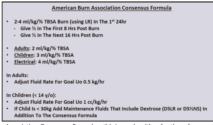
Figure 3. The American Burn Association Consensus Formula—this is an algorithm for the safe resuscitation of large burns in children and adults. It segregates burns based on predicted fluid needs in an attempt to avoid overzealous crystalloid resuscitation and by adjusting fluid rate in accordance with hourly urine output.

First, an airway can be compromised because of the direct effects of the burn. This is the most obvious indication for intubation before transfer. Signs and symptoms include pertinent history (burned in a closed space such as a car or mobile home or house fire) extensive head, neck, or facial burns; carbonaceous sputum and singed nasal or facial hair; and later on, the development of airway stridor. If even some of these signs or symptoms are present, it would be reasonable to intubate before transfer.<sup>24</sup> A second reason for intubation before transfer in a serious burn is obtundation caused by carbon monoxide poisoning. As a general rule, if the measured CO level is greater than 30% and transfer is imminent, intubate before transfer. If, however, transfer to the burn center is delayed for some reason and the patient is not obtunded, it may be reasonable to place the patient on 100% oxygen and monitor for improvement, as CO levels should be normalized within less than 90 minutes. A third reason for intubation of a serious burn before transfer is the size of the burn. If the patient has a large burn (>40%) TBSA), it can be expected that the patient will become very edematous over the next few hours and will become relatively ill within 6 hours. It is also reasonable to assume that this patient will require relatively large doses of parenteral narcotics and benzodiazepines for pain control and sedation. It is prudent to intubate before transfer in this circumstance.